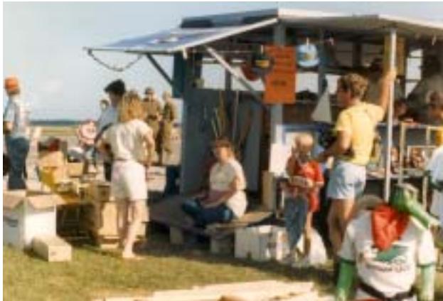
The first WHS PX trailer killed a number of transmissions (it weighed a ton)