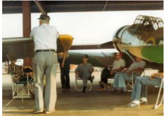
In between Weiser Airport and Hangar B-5, there was a time where the normal meeting place was under the sheds on the east side of West Houston (then Lakeside) Airport