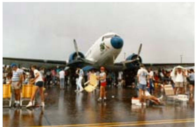
Draggin' Lady, in her "dress whites", provided a handy shelter during Wings Over Houston rain squalls