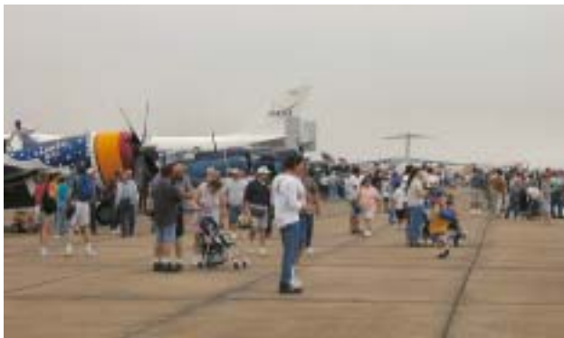
Two perennial favorites at Wings Over Houston are the Warbird ramp and the Airpower demonstrations