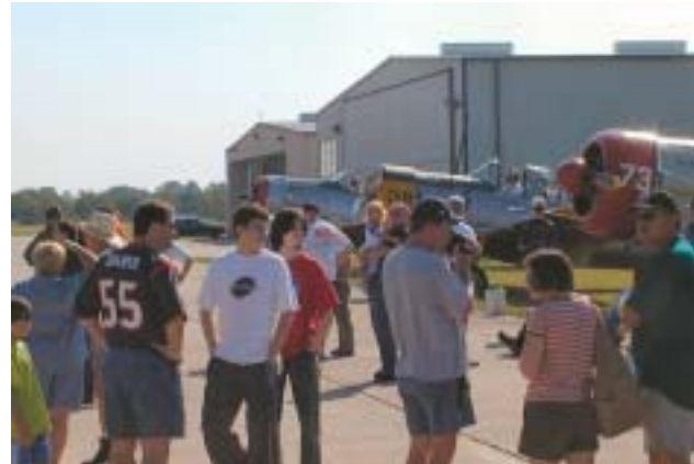
The squadron Open House events always draw a crowd