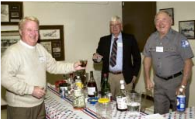
The busiest guys in the house - the bartenders