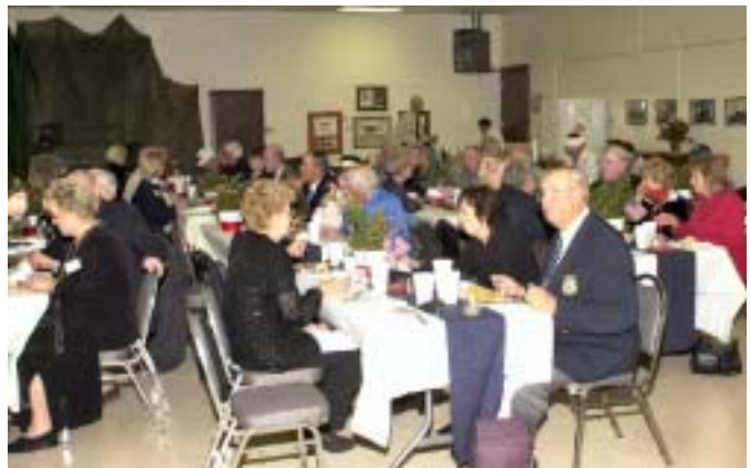
The food and the décor were both great