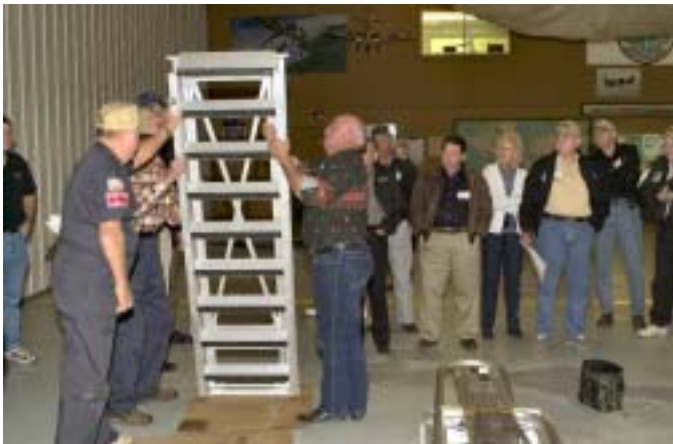
The new Wing Walk is assembled using the DOT-approved worker-to-watcher ratio, normally seen on highway work crews (minimum eight watchers/advisors/critics for each person doing actual work)