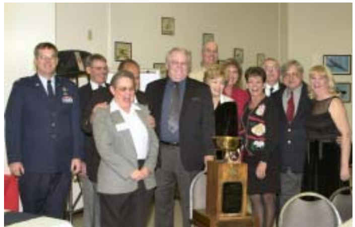
The DEW Line Squadron received the Kale Webster award at Flughafen in recognition of their outstanding performance in 2003.

(reprinted from "Contraails", January 2004)