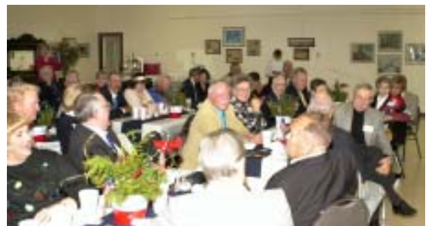
All Flughafen pictures provided by Paul Studley