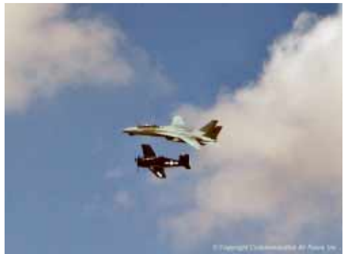
Navy Legacy Flight