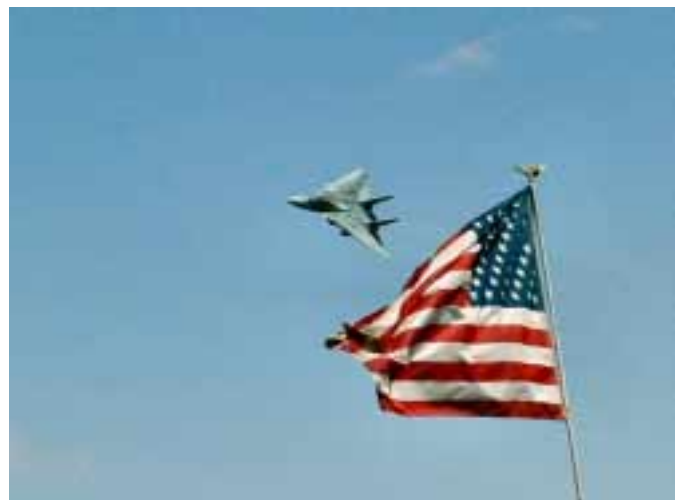
F-14 Demo, high speed photo pass