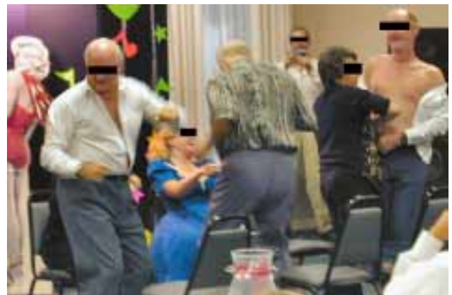
... The Foolishness. Identities have been masked to protect the guilty (there were no innocent).