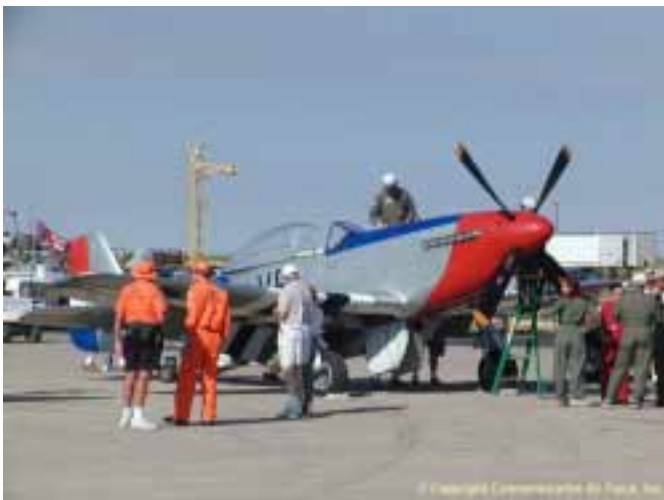
Red Nose is flying again