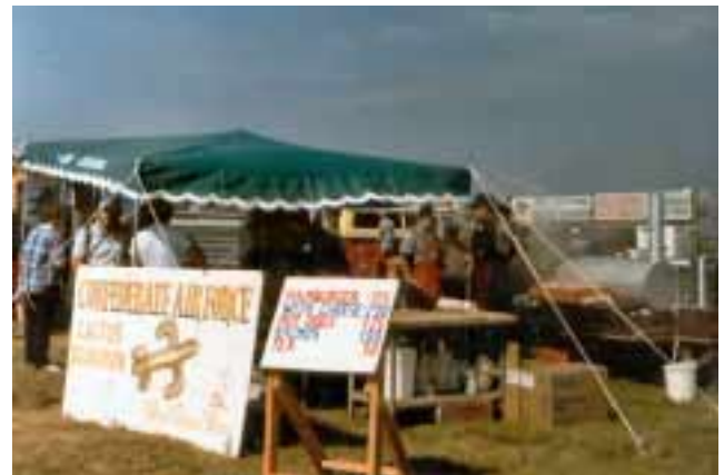
The Cactus Cookers fire up the grill at the Breckenridge Airshow, date unknown