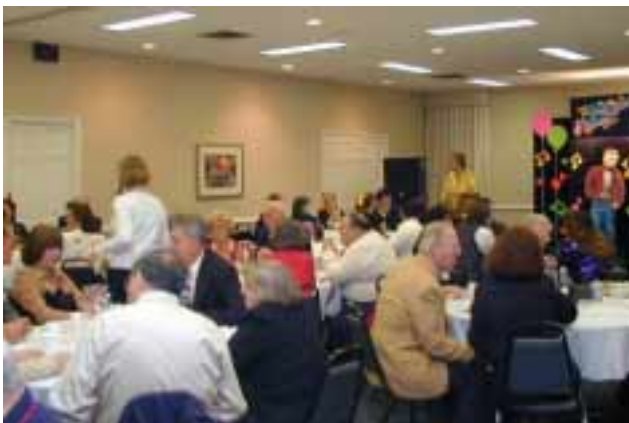
Flughafen 2000 - before the foolishness began ...