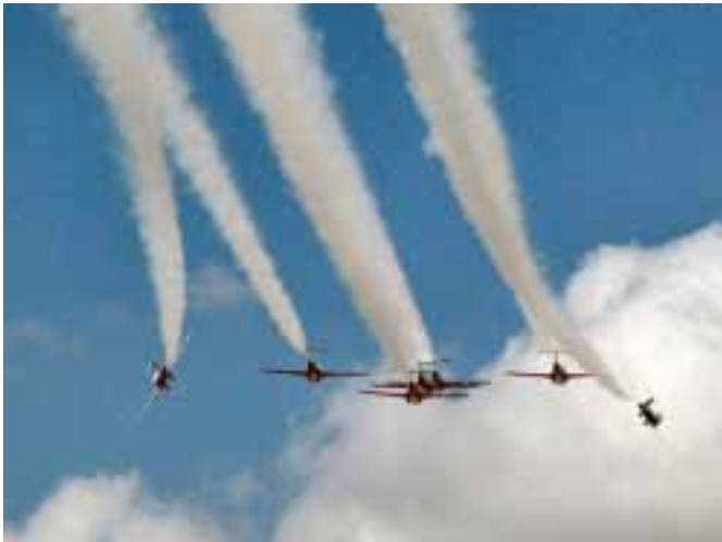
The Canadian Snowbirds