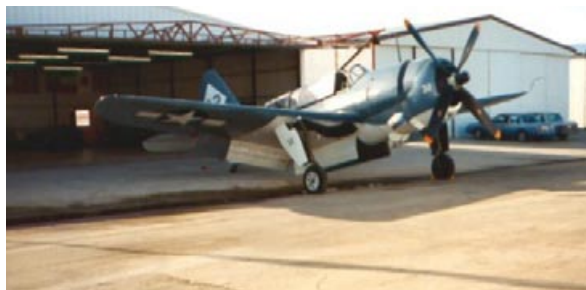
"The Beast" at the Cactus Hangar, Graham

Many are those who have given so much to WTW, we could mention all members' names and still miss mentioning credit for some great gifts of time and talent.