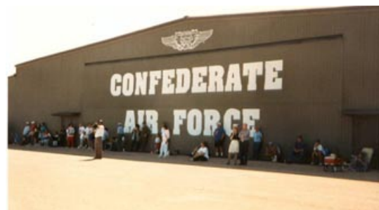
CAF HQ - Opening Day after the Move to Midland