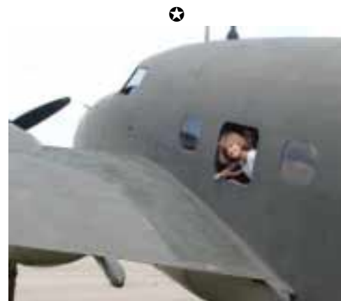
Young visitors tour the C-60 at the WHS Open House